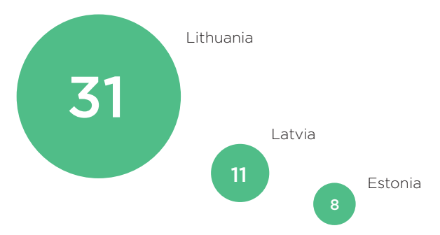
GRAPH 1: Coface Baltic Top 50 – Number of companies per country in 2013